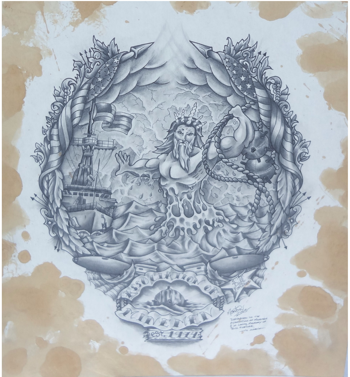
New AOM Emblem