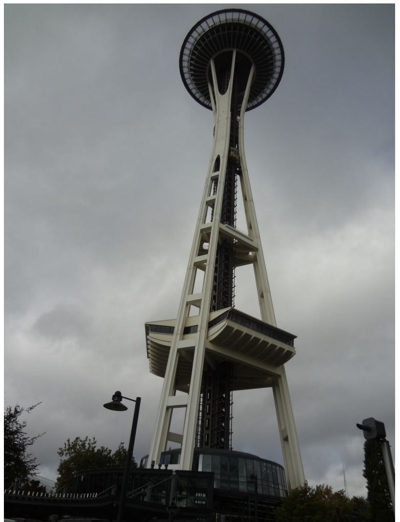
Seattle Space Needle