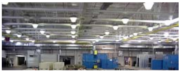
All of this and we still have room for....

Meanwhile, the main production team had its own operation to complete. The JTFEX-04 had a request in for a few mine shapes to play with. The remaining crew of MOMAU Eleven pulled themselves up by their bootstraps, set their teeth and began the monstrous task of refurbishing 61 mines of various shapes and functions for the exercise. Using the water blaster, jitterbugs, several gallons of white and orange paint and a lot of elbow grease, this colossal undertaking was completed on schedule.