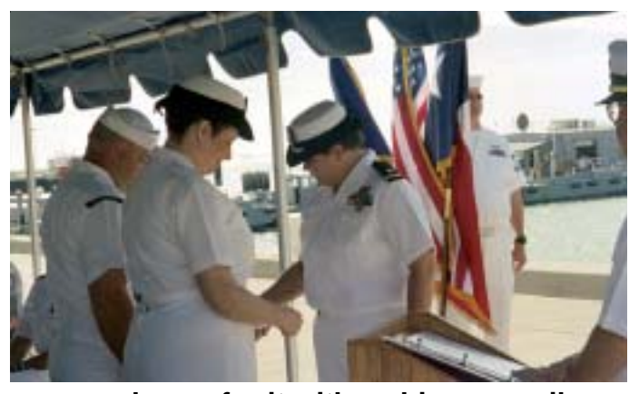
... and pays for it with a shiny new silver dollar continuing a centuries old tradition.