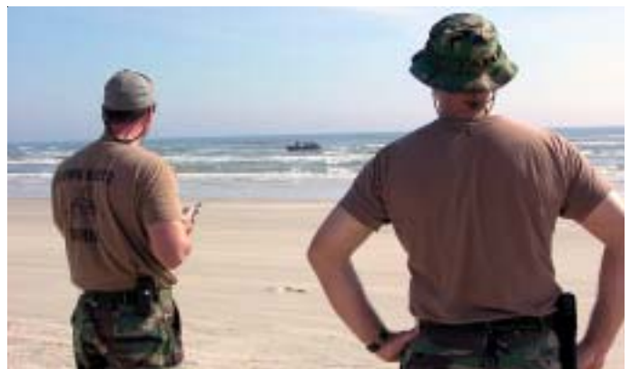
Watching from the beach