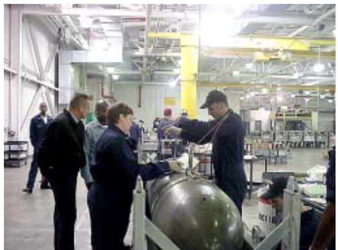
MOMAU Eleven and Reserve Units 6 and 7 train during MK 65 Buildup

Good wishes from the beautiful Low Country! Hope the start of 2005 has found all of you well and ready to face another year. We'll start off by reporting that the command has completed the following missions in support of Commander Second Fleet, Joint USAF/USN exercises and CNO projects: CJTFEX 04-2 Recovery, USAF COUNTERSEA SYLLABUS SORTIE/CLASS 05A MINEX, and DDX ISUW EDM. In addition to providing mines to the fleet, we are preparing for our Mine Recertification Inspection (MRCI) 9 – 13 May, Administrative and Material Inspection (ADMAT) August 2005 and Explosive Safety Inspection (ESI) October 2005.