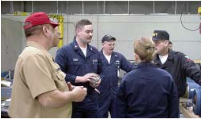
MOMAU Eleven and Reserve Units 6 and 7 train during MK 65 Buildup