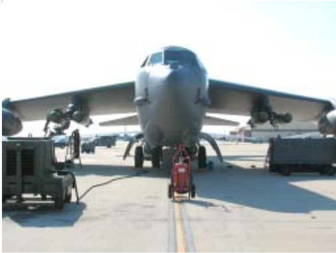
MK 56 Mines provided by MOMAU Eleven and MOMAU One loaded on B-52 at Barksdale AFB