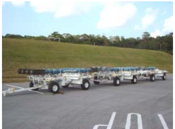
"Assembled MK63 QUICKSTRIKE's ready for the flight line"