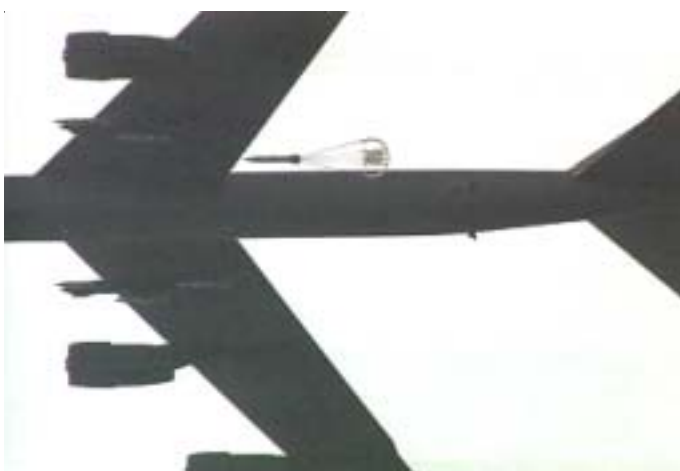
Mk 63 run