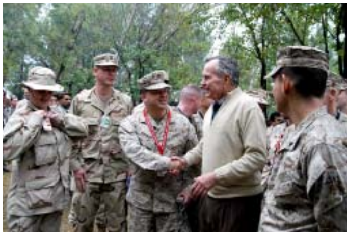
41st President George H.W. Bush 16 Jan 06

Simply put, things like this do not happen to small town folk from Idaho... It was awesome... a day to remember... I got the trifecta... Looks like I will be leaving Pakistan now around 8 April...."