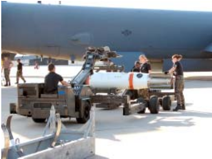
MK 65s provided by MOMAU Eleven and MOMAU One loaded on B-52 Being Loaded at Barksdale AFB