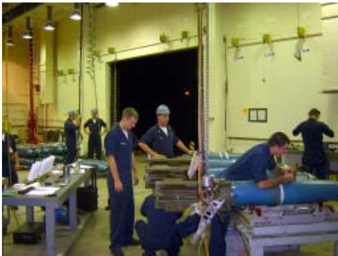
"MOMAU 10 personnel assembling QUICKSTRIKE UMN's MK63 TERMINAL FURY 05"

COMOMAG Operations has been working closely with MOMAU ONE as they plan and execute their Surface Launch Mine Delivery Demo scheduled to coincide with the USAF MINEX this March at the southern California SCORE range. The annual Waterfront Ordnance Conference will be held at NAVSTA Ingleside 21 through 23 March. Twenty-four of 26 MCM/MHC's have finished the required Conventional Ordnance Safety Review (COSR), and FY06 NCEA Expenditure Summary Reports for all MCM/MHC class ships are 100 percent completed. COMOMAG continues to work with CSS in resolving issues with Test Set calibration. The age of MK50 series test sets has seen the availability of condition code "A" replacement test sets decline, coupled with the obsolescence of required standards to calibrate ones currently held at the MOMAU's. We hosted the MK56 IRE conference in February. Representatives from PEO Washington, NSWC Panama City, Yorktown, Keyport and Hawthorne were in attendance confirming requirements and finalizing the POA&M for this