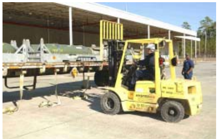
Loading Mines onto Trailer to Transport to Magazine