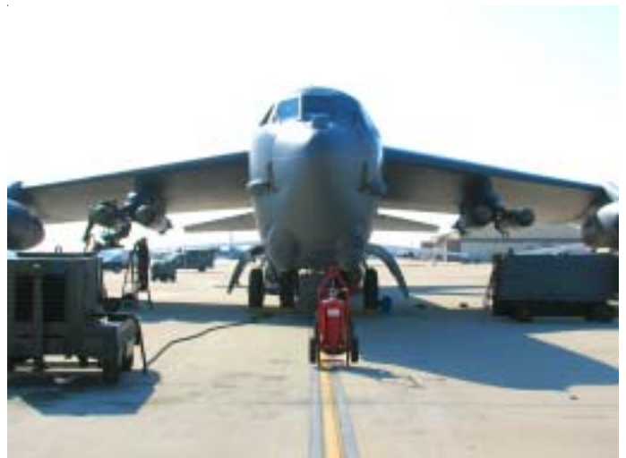
B-52s ... still flying, still bombing, still mining.