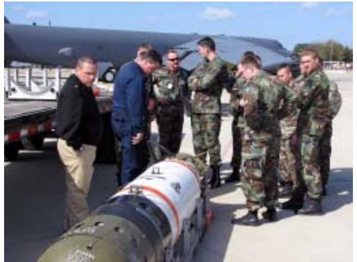
Animal, mineral or vegetable?