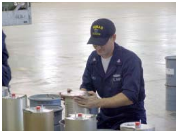
Breaking Out TTDs

We remain busy preparing mines and sending MAT teams to the fleet to support mine exercises. We have prepared approximately 75 mines for various exercises.