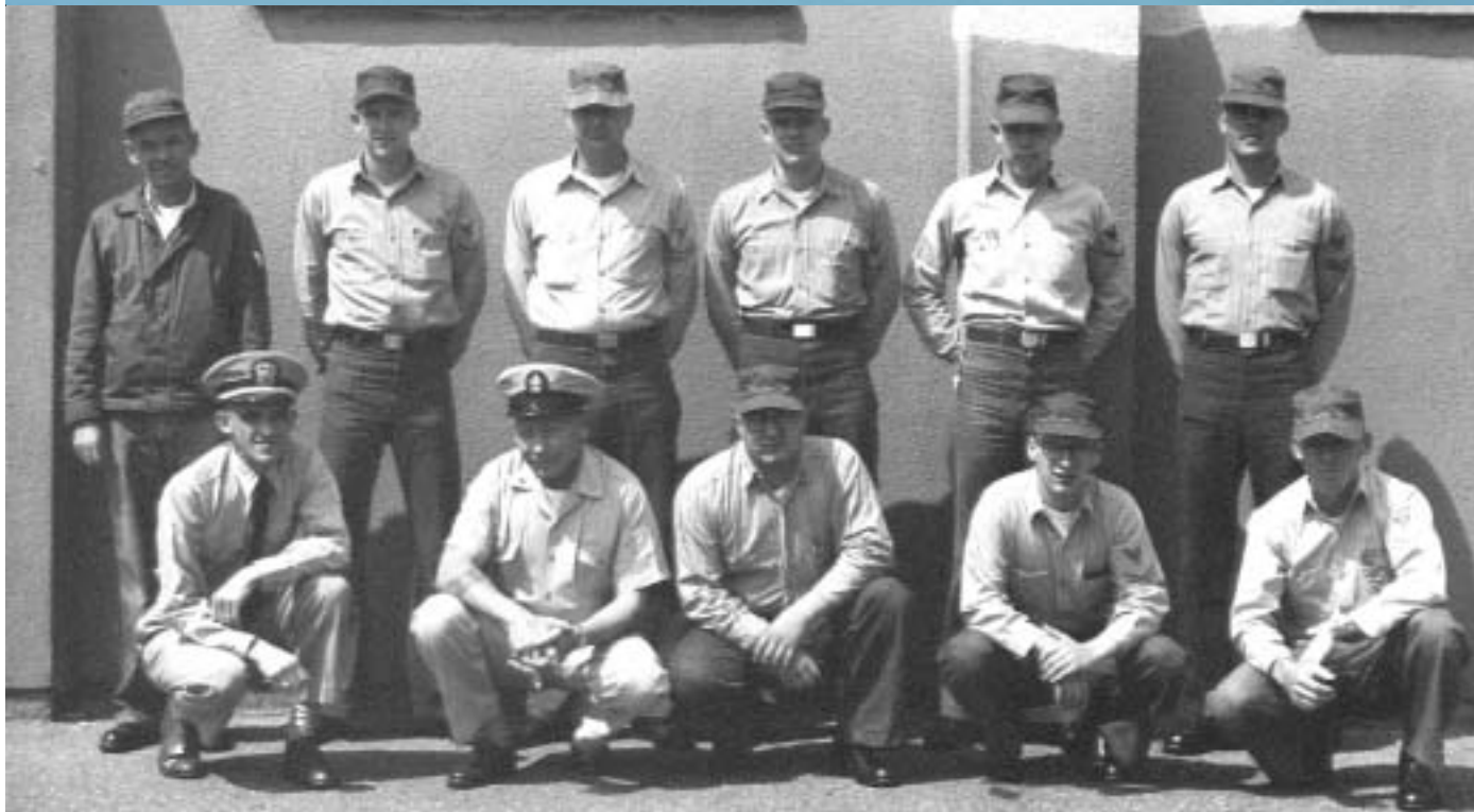
Mildenhall Det Bravo - 1964