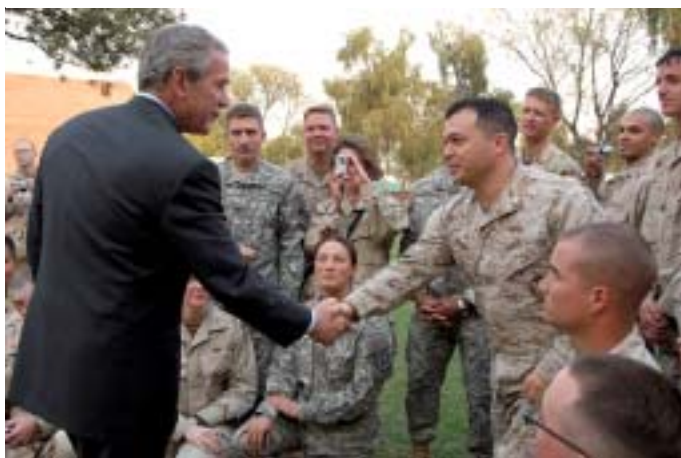
43rd President George W. Bush 4 Mar 06