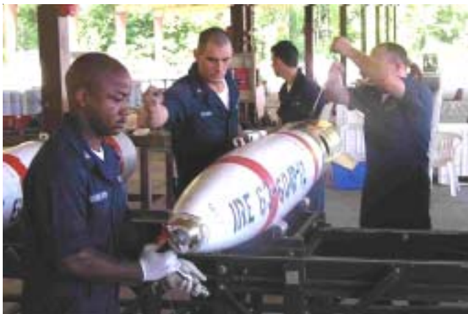
MOMAU 11 personnel assembling MK63 QUICKSTRIKE

Misawa, Japan continues to experience a heavy winter this past quarter. They have reported that snowfall has reached in excess of 72 inches on the ground. As we gear up for the In-Water Reliability Evaluation (IRE) this fall with the MK56, I will leave you with some pictures from a previous MK63 QUICKSTRIKE IRE. Take care, God Bless and stay safe.