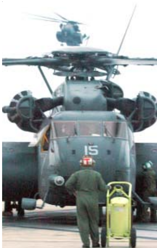
Big rascal, isn't it?