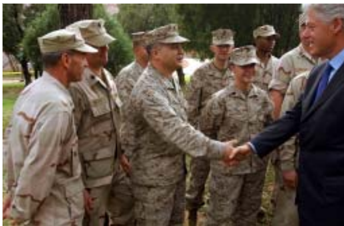
42nd President William J. Clinton 17 Feb 06