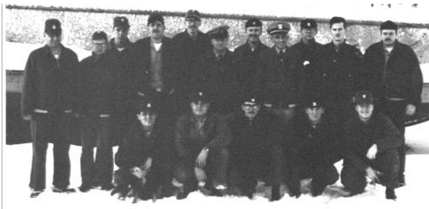
Keflavik Iceland - 1968