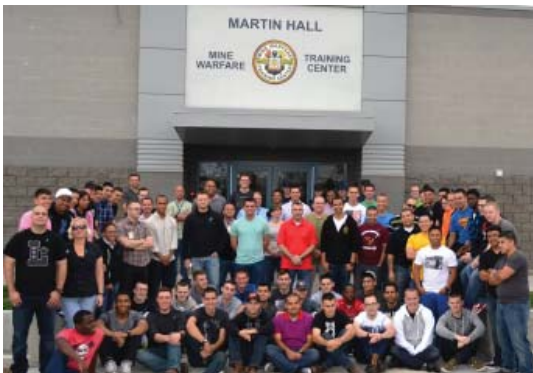
MWTC supporting Denim Day.