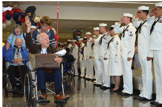
MWTC proudly salutes our veterans of WWII on their return home.