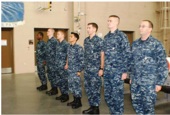
Class AN/SQL-48 OPS Graduates