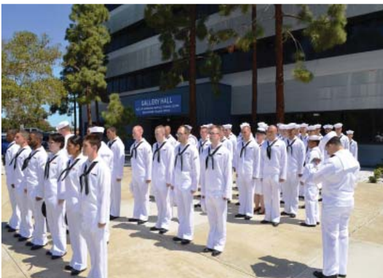
MN'A' School Dress White Inspection